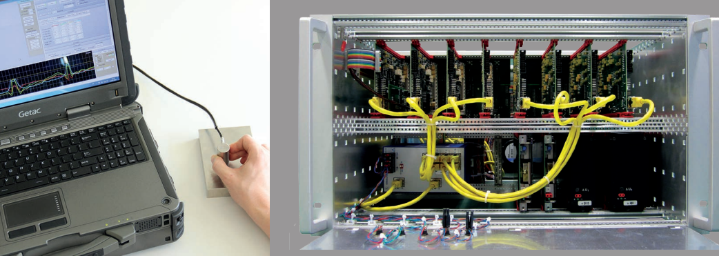
Mobile eddy current inspection system