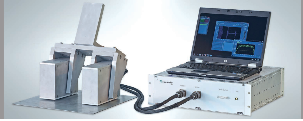
MAGNUS with holder